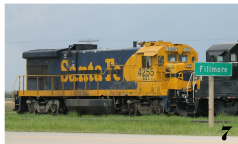
SSR 4255 takes a break at Fillmore, SK in June 2014.

All this goes to demonstrate that if you have a model railway, you can run just about anything and say it matches the real world prototype! Happy training! ◀◀