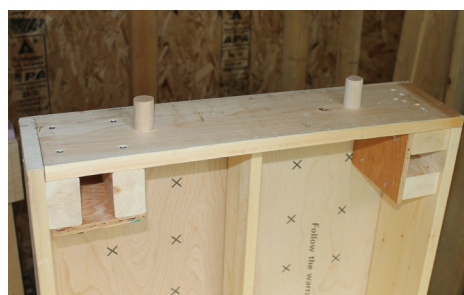
Photo 3- Short pieces of one inch dowel are in place

Special corner modules will be built using a sufficient track radius to allow for up to 85-foot cars to be used.