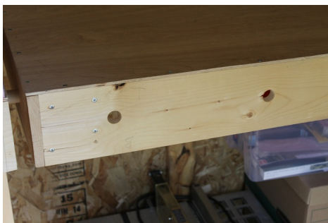
Photo 2- Note the one inch holes drilled every 12 inches.

In this way modules will interconnect either end to end or at a 90 degree angle. By using standard track layout measurements, modules will always connect.