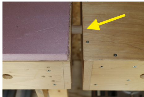
Photo 4- Note how the dowels allow adjacent modules to line up consistently.

In this case, the siding track will be laid out and extra half inch (four scale feet) away from the mainline. This would allow for signals, wayside poles or other items to be installed.